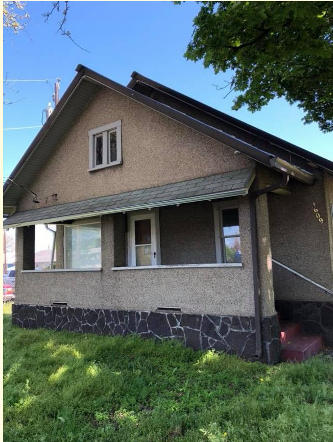
Warming Station Location in 2018/2019