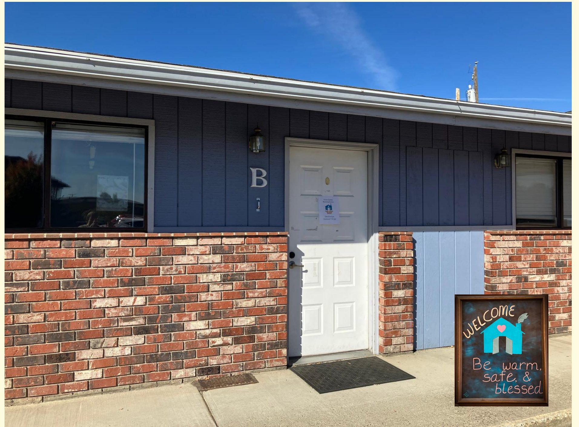
Warming Station Location in 2020-2022