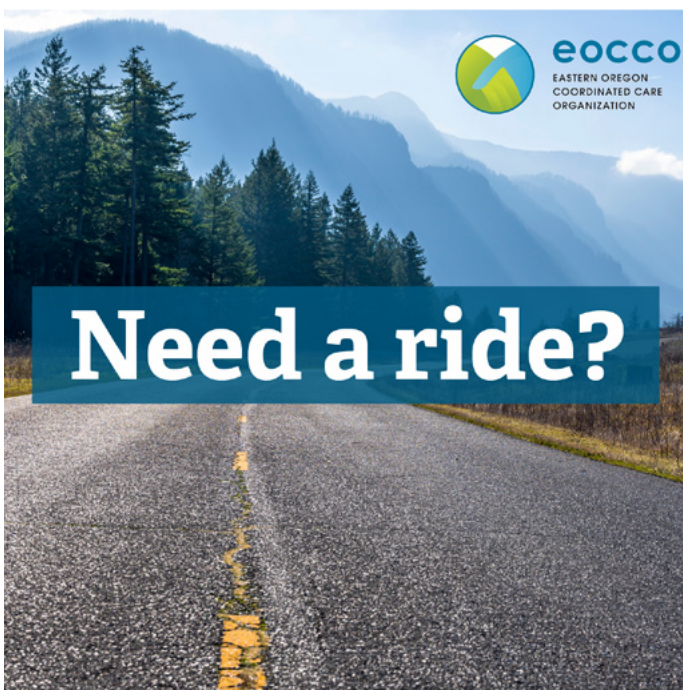
Download image #3